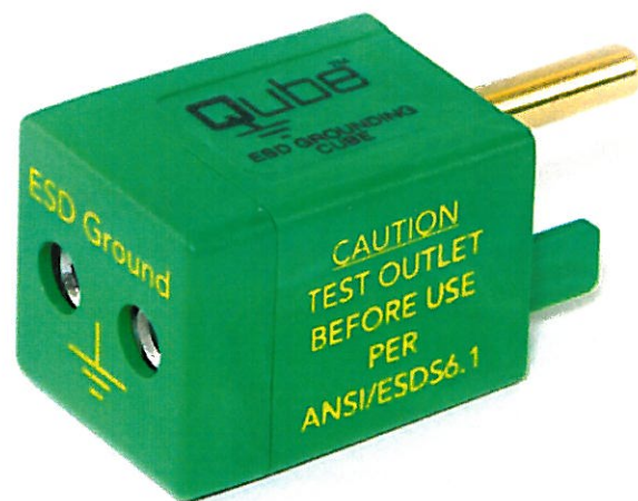
Q007 ESD GROUNDING CUBE

The new Prostat Qube™ replaces expensive electrical ground circuit testers and indicators with a convenient, cost effective means to connect vital ESD controls to grounded electrical outlets. Use the Qube to ground workstations, mats, wrist strap testers, instruments, and other ESD products to an approved pre-tested facility electrical ground. It consists of a heavy duty dual banana receptacle frame encased in fire retardant ABS with a solid brass grounding pin.